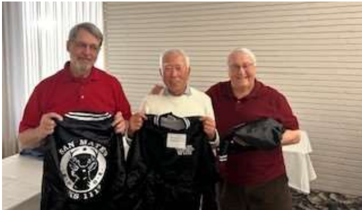
League CHAMPS – Team 4 – Wednesday 4pm