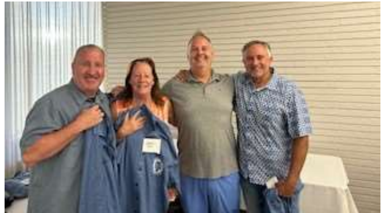
2 nd Place – Team 2 –Thursday Night