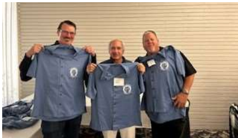
3 rd place – Team 2 – Wednesday 730pm